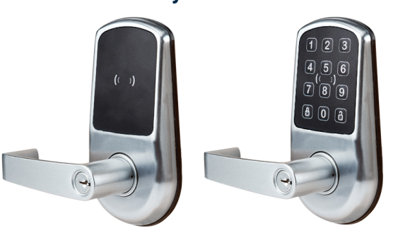
6EWS-SP Heavy Duty Electronic Exit Device Trim