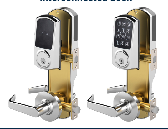
MRS-SP Heavy Duty Electronic Mortise Lock