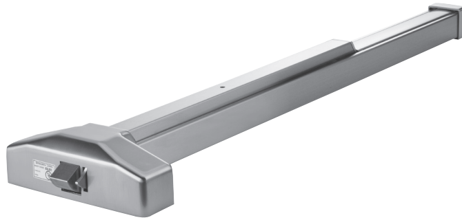
RIM ANSI TYPE 1